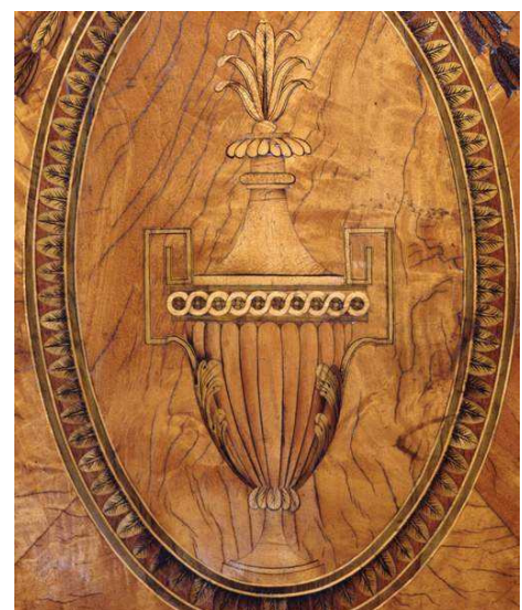
Top left—Detail of the fan from the Diana and Minerva Commode, Harewood House